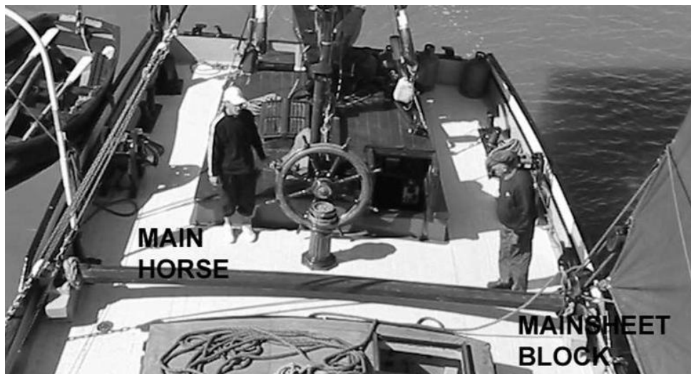
The picture above shows the deck view aft and clearly illustrates the main horse. In the lower right of the picture you can see the mainsheet block too. When the barge changes direction the sails can come across from one side to the other. Of course you'll be told what's happening and warned what to do or not to do but the skipper and mate will be insistent that you don't get in the way of the mainsheet as it slides across the main horse!

Our barges are crewed by a qualified Thames sailing barge Master and an experienced mate. Sometimes we have a third hand or a trainee mate too. The skippers and mates have many years of experience of sailing barges and they know what it's like sailing with both hardened sailors and inexperienced new people. They will want to help you learn what to do but if you just want to relax they will be happy to let you keep out of the way!