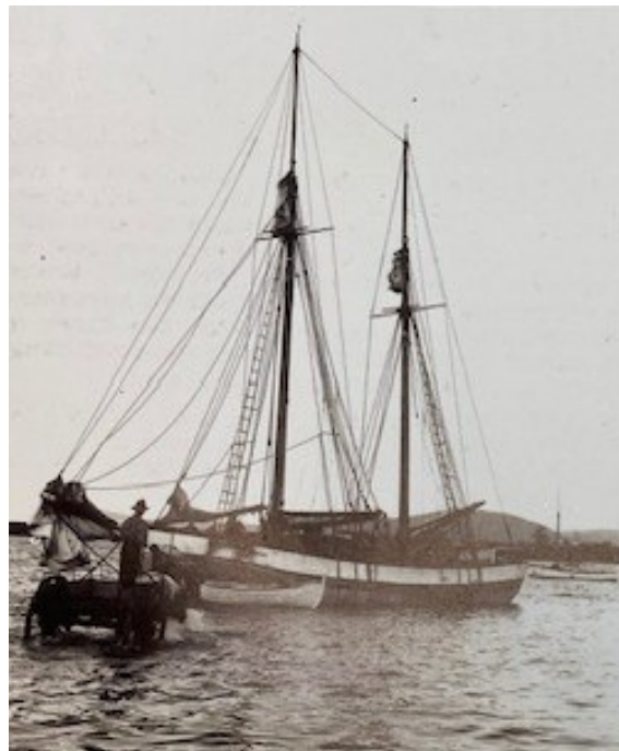
Scow Kajaia discharging firewood Picture from the book History of New Zealand Scows and Their Trades by David Langdon 2009

Scows came in all manner of shape and sizes and all manner of sailing rigs, but the "true" sailing scow displayed no fine lines or fancy rigging. They were designed for hard work and heavy haulage and they did their job remarkably