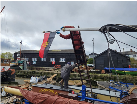
Adding the new Bob onto Centaur

While cleaning the cabin top decking ready to apply a new coat of sadolin it was noticed that there was a soft patch on one of the deck planks which ran under the timber pedestal supporting the forward end of the steering wheel spindle and its bearing. We had rebuilt the cabin top back in 1987 and this was the first sign of any problem. The steering spindle was supported on blocks and the bearing assembly removed to allow removal of the timber