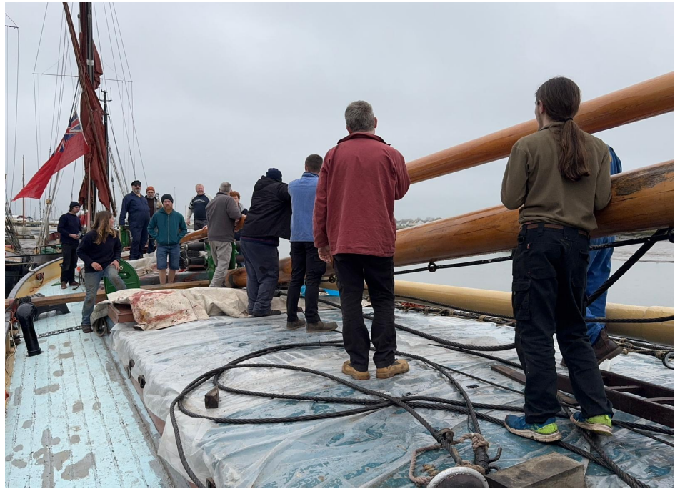
New Topmast being lifted into place on Pudge