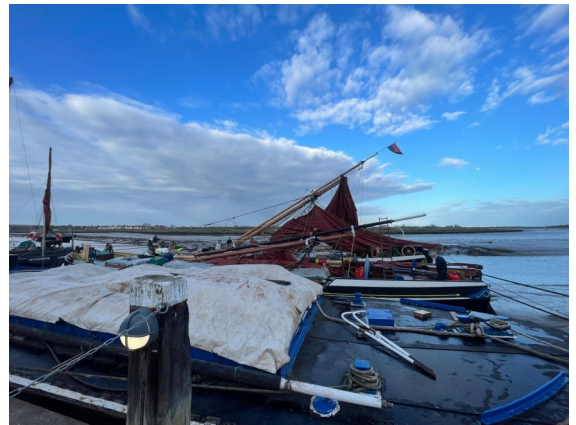
Centaur being re-rigged