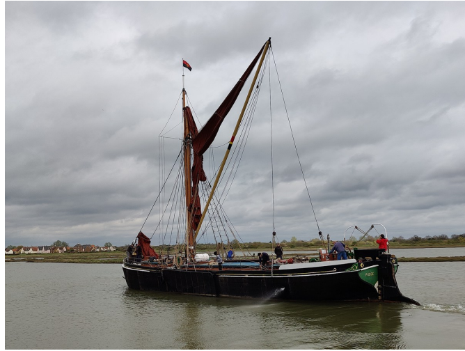
Pudge heading for Fullbridge on Good Friday