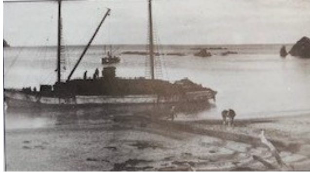
A scow loading timber in the 1930s

During a recent trip to New Zealand and the city of Wellington I paid a visit to the Wellington Maritime Museum. When you think about New Zealand and its surrounding coast, one would have expected a large museum, however the museum just occupied one floor of the main Wellington Museum. However, during my time, I noticed a small exhibit about the New Zealand Scow.